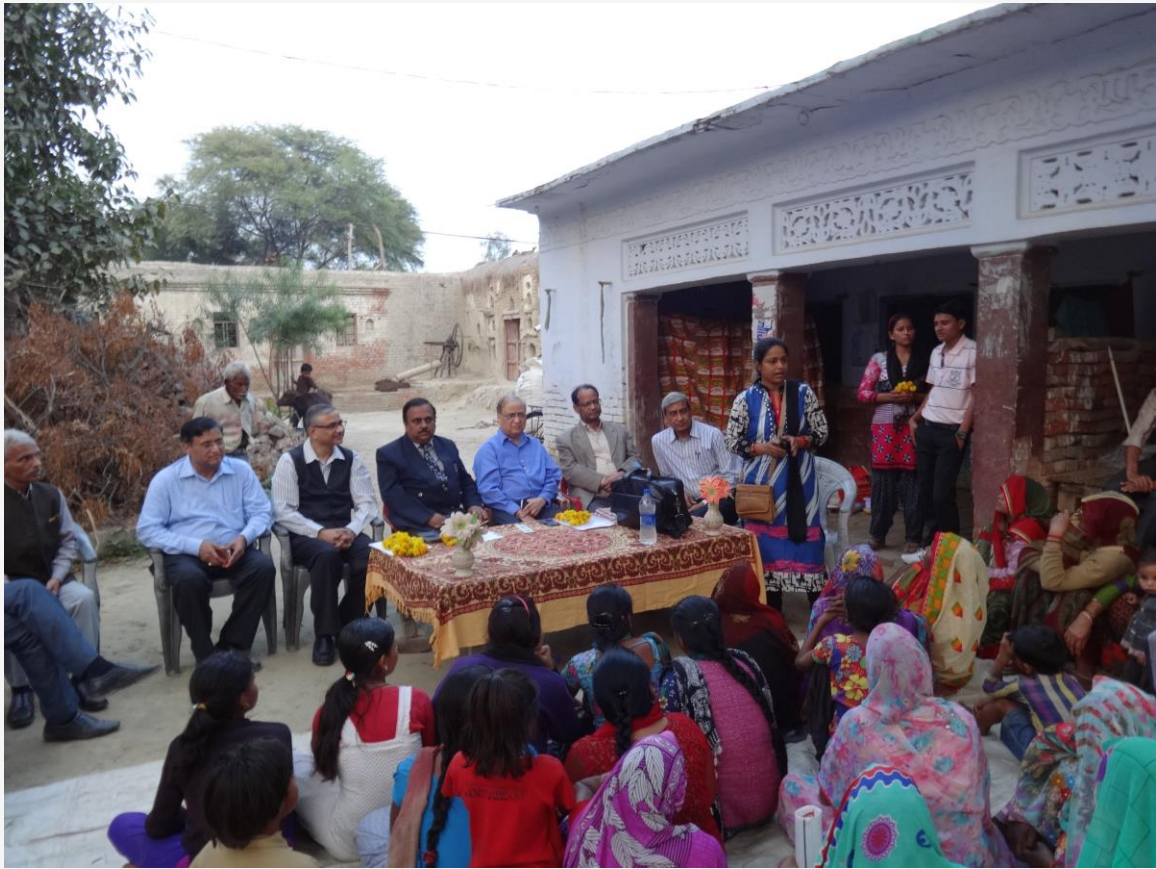
Visit to the First Adopted Village Banaralipur, Kanpur, Dehat, UP on 2-20-2016