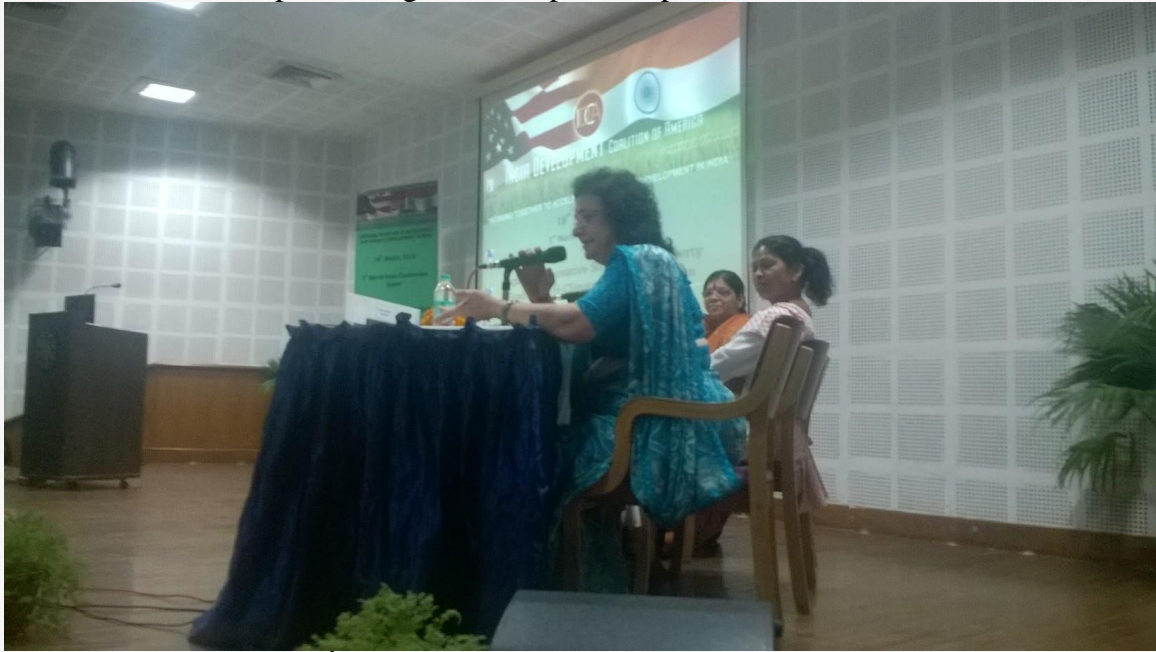
Healthcare Panel at the 5 th North India regional Conference in Jaipur on March 18, 2016.