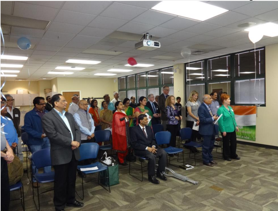
All present repeating the Water Pledge